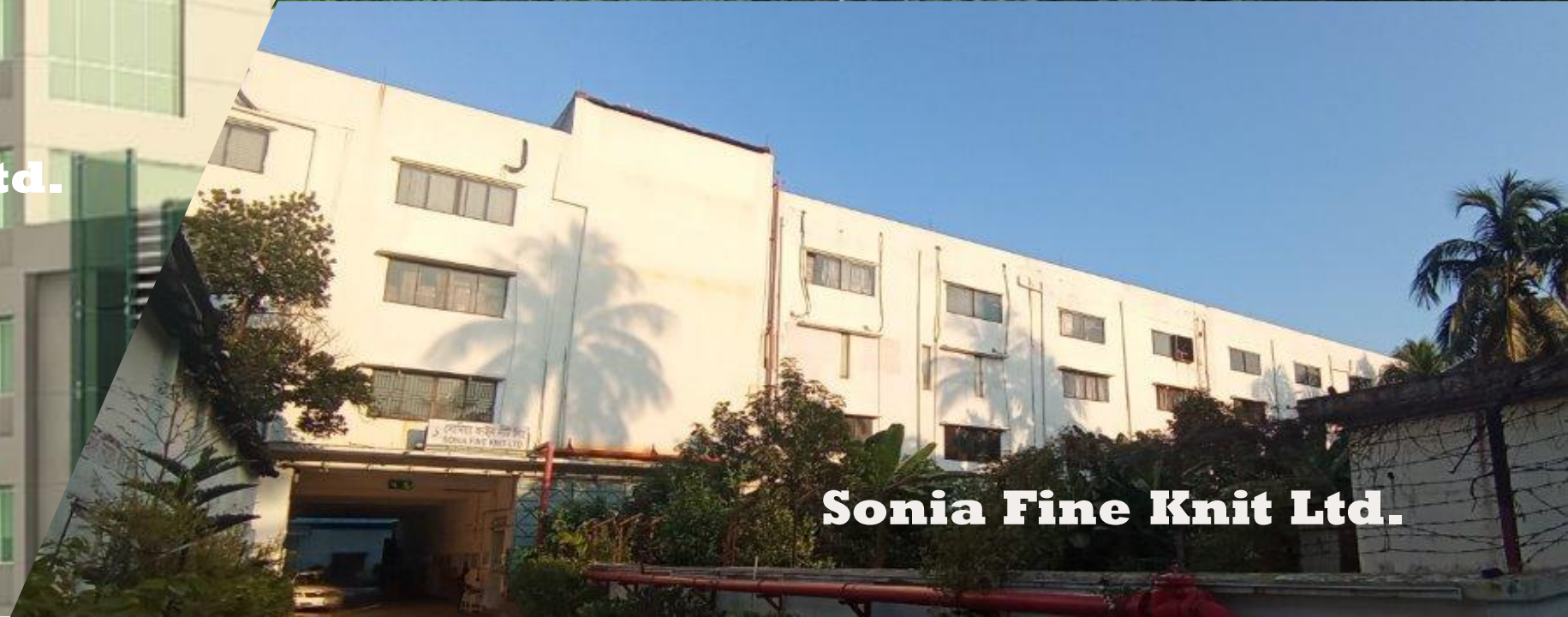
Sonia Fine Knit Ltd.