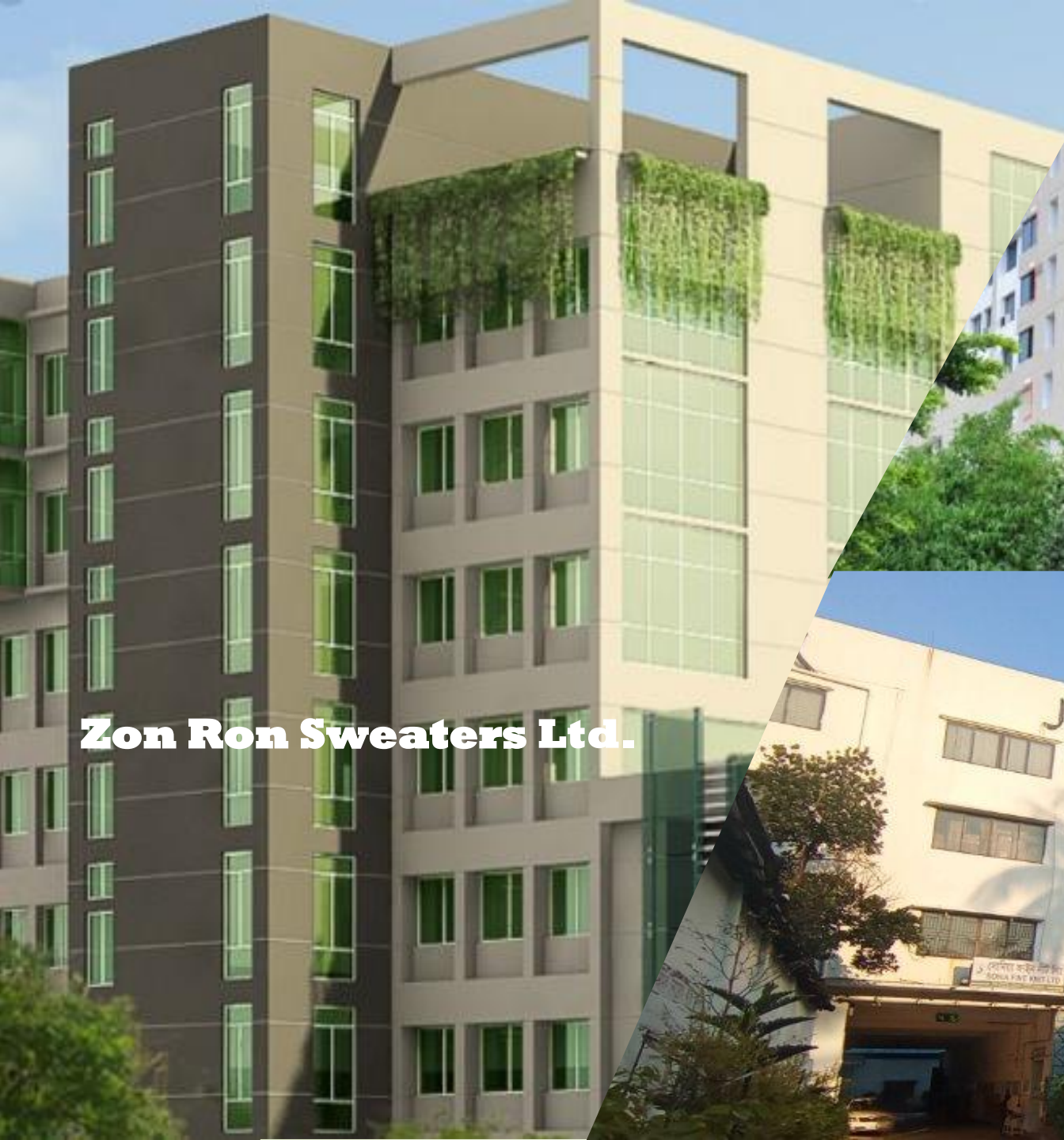
Zon Ron Sweaters Ltd.