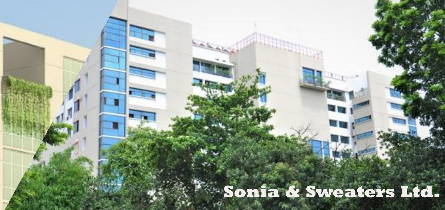
Sonia & Sweaters Ltd.